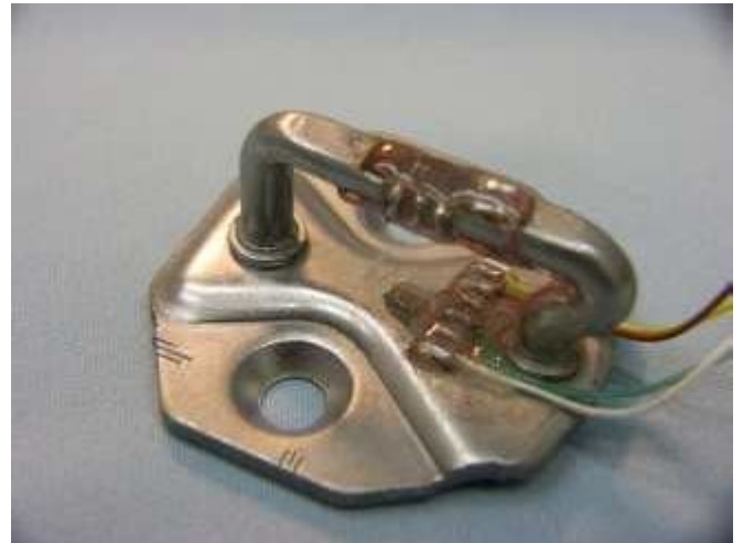
Test automotive lock