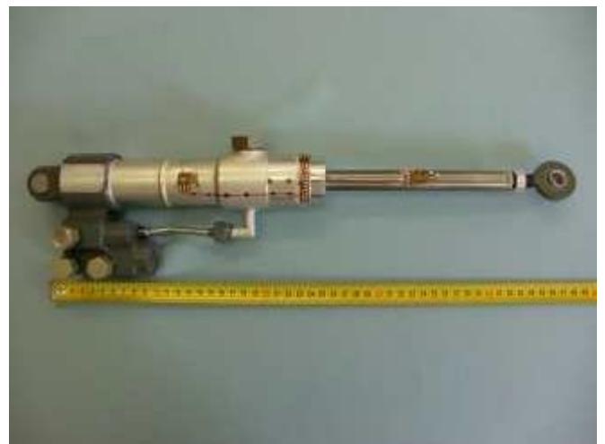
Stress in the pressure cylinder